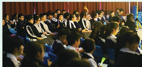
主恩好聲音——台上台下氣氛熱鬧