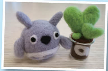
Woolfelled Craft Hung Cheuk Fung (3A)