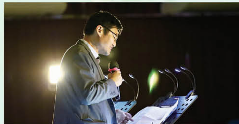
主恩好聲音——老師分享