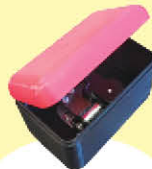
Tsang Yung Hin (3C)