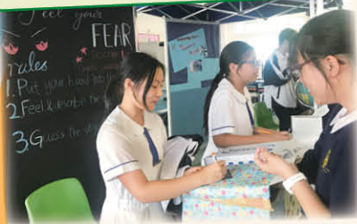
Students participated actively in booth games on the first English Speaking Activity Day