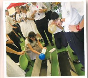
同學於STEM Day為老師及同學準備有趣的攤位遊戲