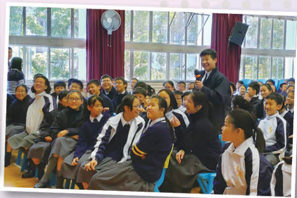
學生放懷投入作家講座活動