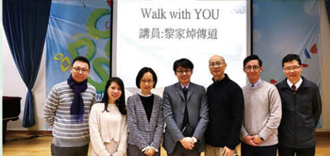
福音周主題——Walk with YOU