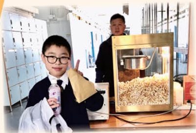
A student got popcorn before the show