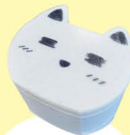
Tong Yuk Yin (3D)