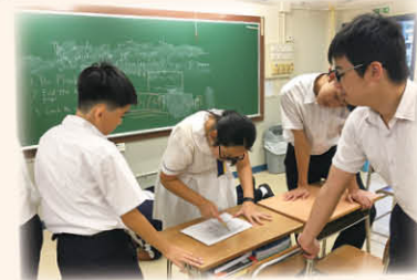
Students solving a riddle in the Treasure Hunt

The autumn sunshine brought a spurt of joy to the CDG campus as the ESAD unfolded in a fabulous fashion. It was the annual epitome of our school's inexhaustible energy, ever accentuated in the flamboyance of the festivities. Together with the Geography and History Department, students and teachers soaked up the English-rich atmosphere to unearth mysteries through engaging in booth games and treasure hunts themed on Myths and Legends. Never for a moment was the day a shared memory among the English Ambassadors only, but of the school as a whole, for all to rejoice, recollect and remember.